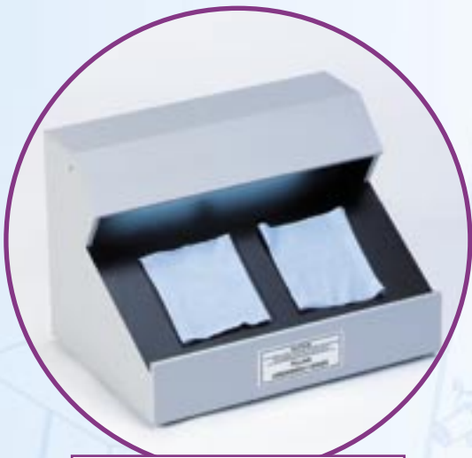
PILLING ASSESSMENT VIEWER