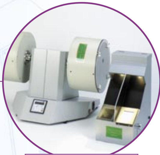
ORBITOR & HOLOSCOPE